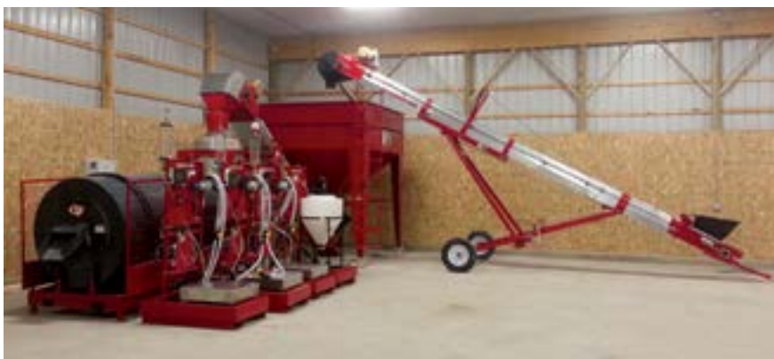
All trademarks are the property of their respective owners.

"This insect piece of Equity VIP isn't used a lot in our area, but it can mean that the growers don't have to have an extra soybean aphid spraying done during the season," says Cook.